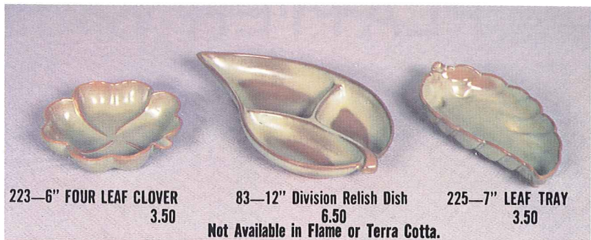
223—6" FOUR LEAF CLOVER 3.50 83—12" Division Relish Dish 6.50 225—7" LEAF TRAY 3.50 Not Available in Flame or Terra Cotta.