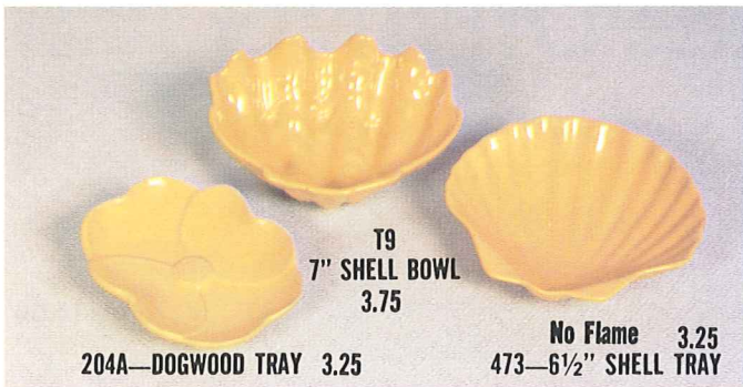
T9 7" SHELL BOWL 3.75 204A—DOGWOOD TRAY 3.25 No Flame 3.25 473—6½" SHELL TRAY