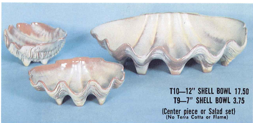
T10—12" SHELL BOWL 17.50 T9—7" SHELL BOWL 3.75 (Center piece or Salad set) (No Terra Cotta or Flame)