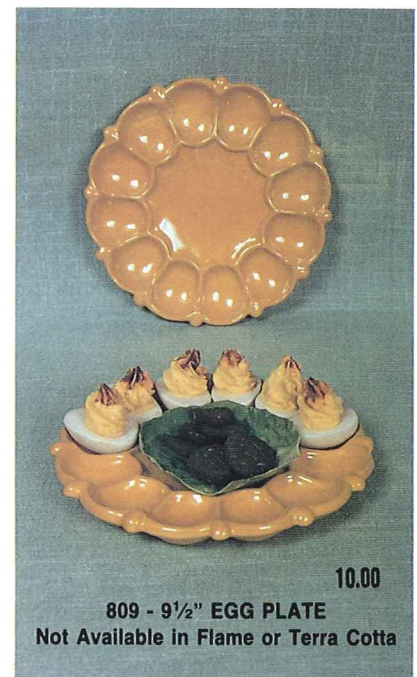
809 - 9½" EGG PLATE 10.00 Not Available in Flame or Terra Cotta