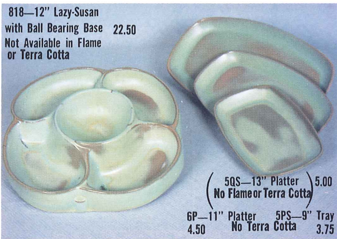
818—12" Lazy-Susan with Ball Bearing Base 22.50 Not Available in Flame or Terra Cotta 5QS—13" Platter (No Flame or Terra Cotta) 5.00 6P—11" Platter 4.50 5PS—9" Tray (No Terra Cotta) 3.75